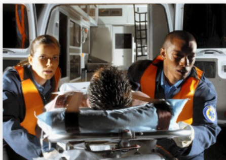
RTP 75 - Emergency Medical Technicians