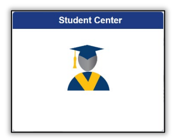
STEP# 3: Select the Financial Aid Tile